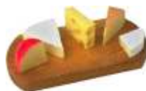
Over 50 varieties of world cheeses in stock NOW